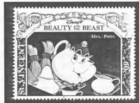
Scott no. 1774d

The second set was issued in February 1993. It consisted of a set of six singles (Scott nos. 1768-73), a miniature sheet of nine (Scott no. 1774) and two souvenir sheets (Scott 1775-76). The singles set depicts scenes different than those depicted on the miniature sheet.