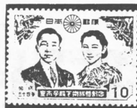
Crown Prince Akihito and Princess Michiko Scott no. 668

His final and most ambitious work was a tetralogy, The Sea of Fertility , the final section of which was completed and delivered to his publisher on the day of his death. In the first volume, Silent Snow , the heroine is said by some to be based upon Michiko Shoda, whom Mishima had once considered marrying. She did not, however, fulfill his strict requirements. She instead married Crown Prince Akihito. Today, she is the Empress of Japan.