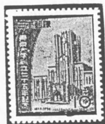
Tokyo University Scott no. 565

He published Kinkakuji ( The Temple of the Gold Pavilion ) in 1956. It is based upon an actual event which had occurred six years earlier in Kyoto. This was considered to be his greatest work and established him, according to the critics, as "a literary genius."