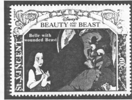
Scott no. 1774g