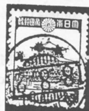
Kinkakuji Scott no. 272

His final and most ambitious work was a tetralogy, The Sea of Fertility , the final section of which was completed and delivered to his publisher on the day of his death. In the first volume, Silent Snow , the heroine is said by some to be based upon Michiko Shoda, whom Mishima had once considered marrying. She did not, however, fulfill his strict requirements. She instead married Crown Prince Akihito. Today, she is the Empress of Japan.