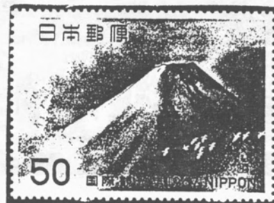
Mt. Fuji Scott no. 931

For a number of years, Mishima had developed an intense feeling of nationalism, desiring a return to the days of the samurai and to restore the Emperor to power. To this end, he raised a private army which he trained on the slopes of Mt. Fuji. On November 25, 1970, he decided his army was ready to put his plan into action. However, the plan was a total disaster. Mishima committed hara-kiri. His funeral at the Tsukiji Honganji temple in Tokyo was attended by over 10,000 people.