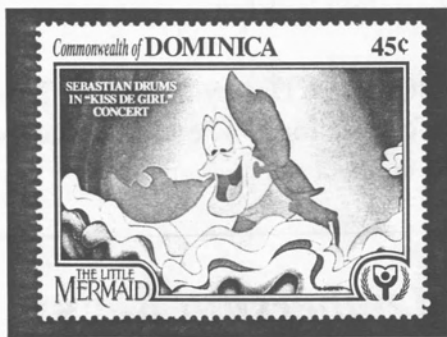
Scott No. 1350

The Commonwealth of Dominica released a 10 stamp issue on August 6, 1991. The set, consisting of eight singles and two souvenir sheets, shows several scenes from The Little Mermaid .