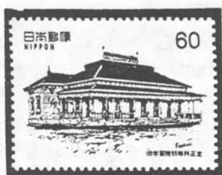
Gakushuin Scott no 1525

Yukio Mishima, the Japanese novelist most widely known for his homosexual novels Confessions of a Mask and Forbidden Colors , was born in 1925. In 1931, he entered the Gakushuin (Peers School) (Japan, Scott no. 1525) from which he eventually graduated at the top of his class. His autobiographical novel, Confessions of a Mask , describes his growing awareness of his own homosexuality during his years at the school.